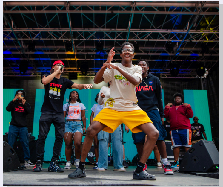
THHT performing live at GLD FSTVL in City Hall Plaza celebrating the 50th anniversary of Hip-Hop music and culture

At Putnam Ave Upper School , we continued providing middle school programming and further integrating performing and recording arts into the daily educational tapestry. We are energized by this year's success and are excited about what the future holds for THHT.